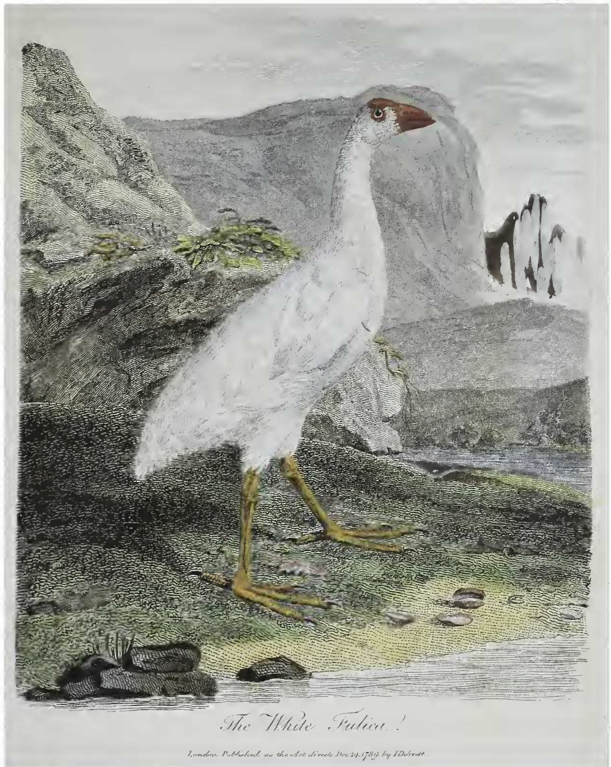
Figure 6. The White Fulica, pl. 27 in White (1790), as depicted by Sarah Stone based on the mounted specimen in the Leverian Museum (Hein van Grouw, Natural History Museum, Tring)